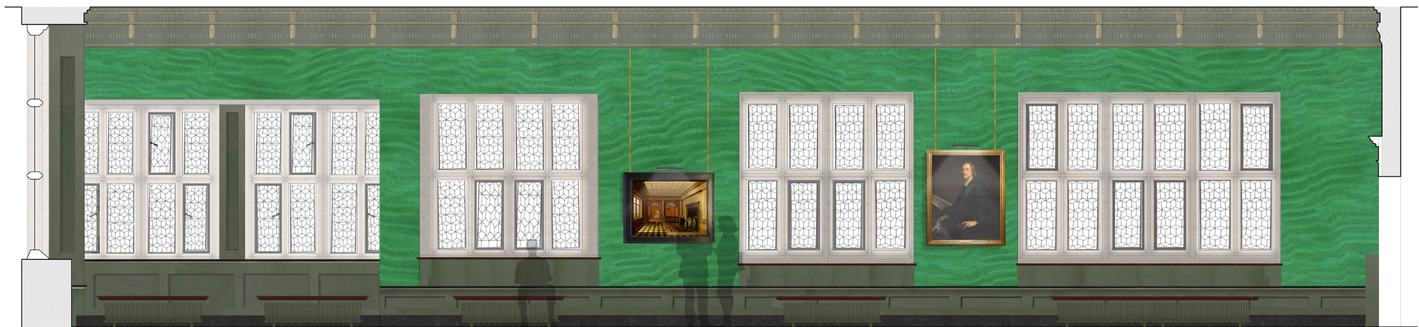
Internal north elevation Initial proposal